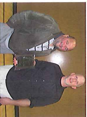
Donahue Tree Farm

The Land Conservation Department (LCD) and Land Conservation Committee (LCC) assist landowners to improve and protect the natural resources of Richland County. The Land Conservation Department and Committee work with other government agencies and conservation groups to achieve this goal. They include UW-Extension, Natural Resources Conservation Service (NRCS), Department of Natural Resources (DNR), Department of Agricultural, Trade and Consumer Protection (DATCP) and Trout Unlimited. The LCD and NRCS field office work hard to provide a seamless delivery of programs. Much of the work that is reported in this annual report is completed in conjunction with NRCS field office staff.